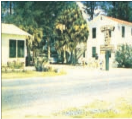
Beautiful Indian Rocks Beach, Fla. "On the Gulf of Mexico"