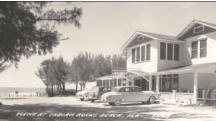
60 - Indian Rocks Inn, where The Fiddler is today