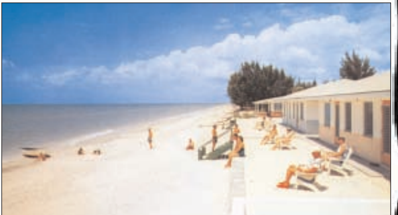
1712 - Comet Apts., today it is the site of the IRB County Park