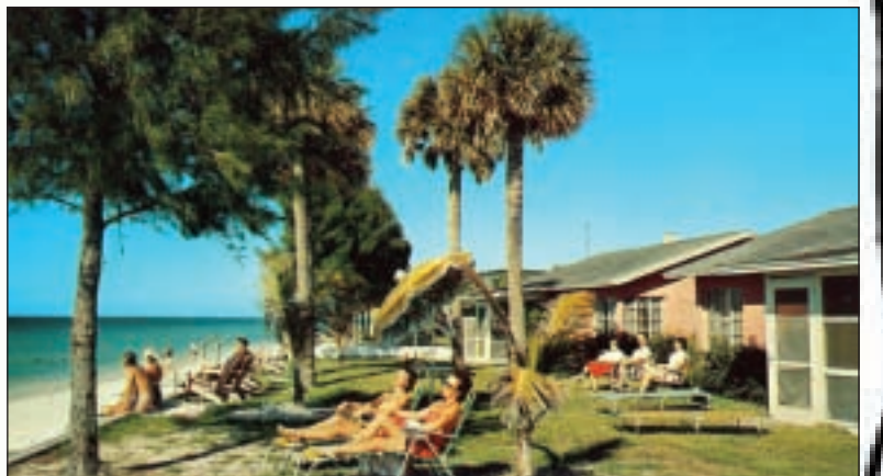
2740 - Holiday Villas, today condos are standing on the site