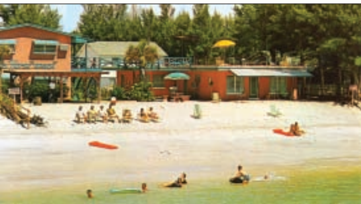
1310 - Sea Horse Ranch, today the Sea Horse Condos