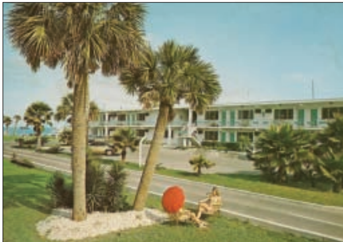
940 - Anchor Court, now the unfinished Da Vinci Condos