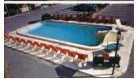
404 - Gulf Towers, still here today