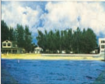
30 - Gulfside Cottages, now closed Sunset Inn