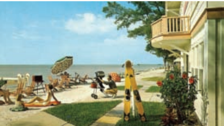
604 - Whispering Waters, now the new Bella Capri Condos