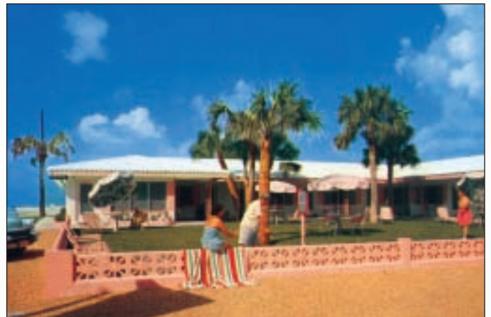
2200 - Holiday Isles Apts., today it is Scopello Condos