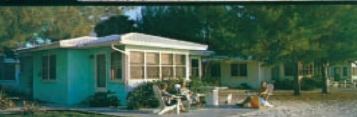
1312 - Glen Haven Homes, Dolphin Reef Condos, but part is still there