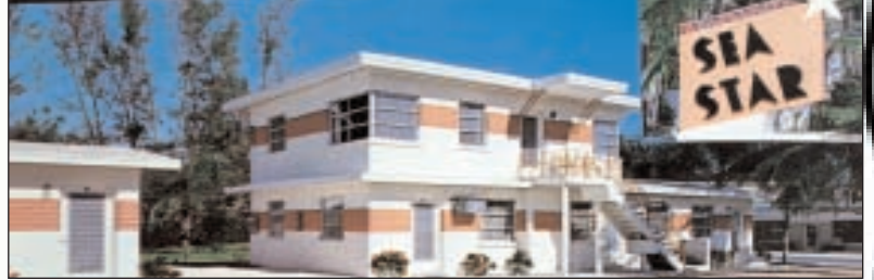
412 & 430 - Sea Star Motel, now residences & Pier House Condos