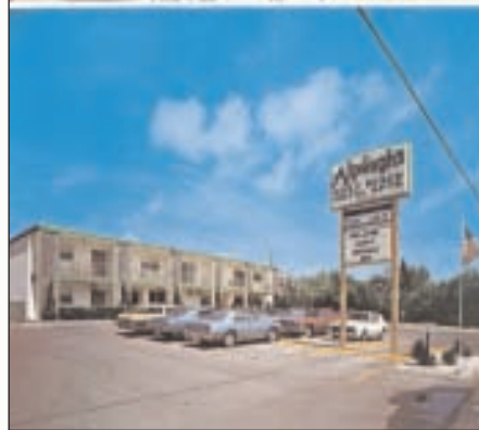
68 - Alpaugh South, today the Great Heron