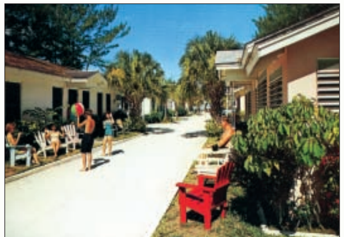
990 - Rainbow Cottages, still there as Blue Heron Cottages