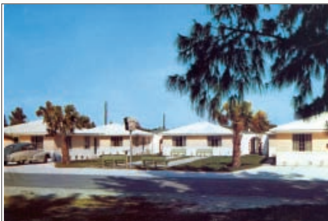
1751 - Twin Arch Apts., still here just north of Guppy's